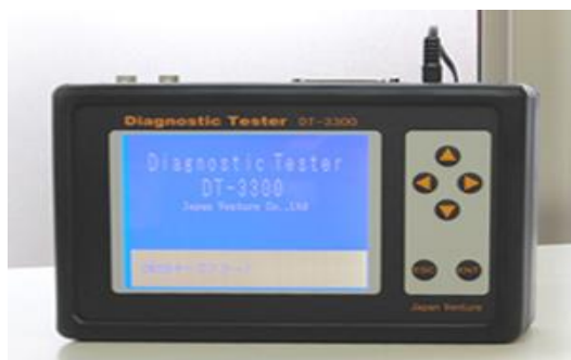
(ELECTRICK) SCAN TOOL {AUTOMOTIVE DIAGNOSTIC TOOL}