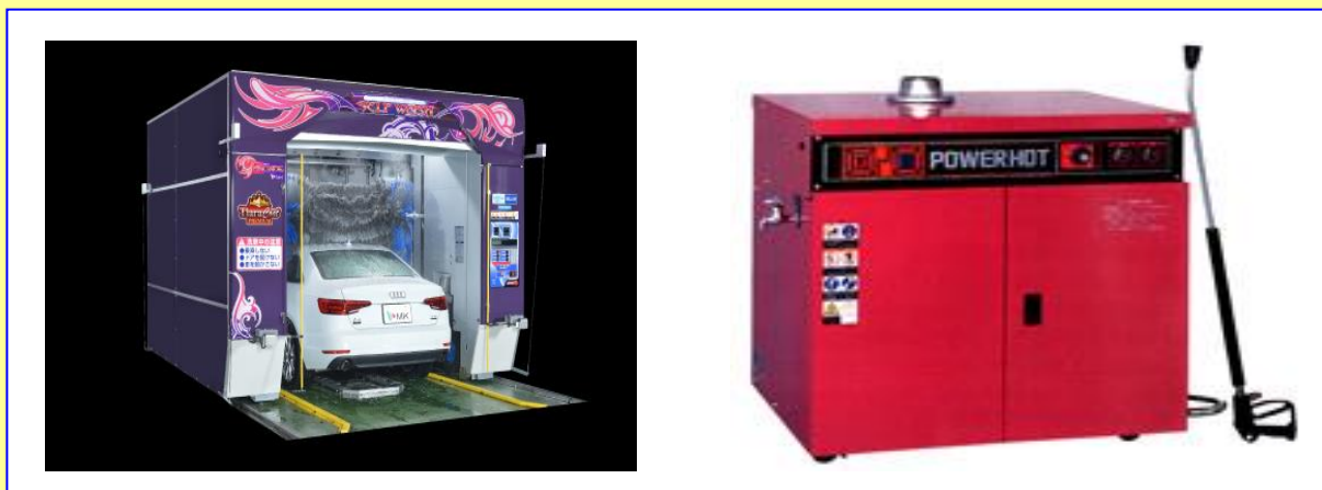
(WASHER) GATE TYPE WASHER, HOT WATER CAR WASHER