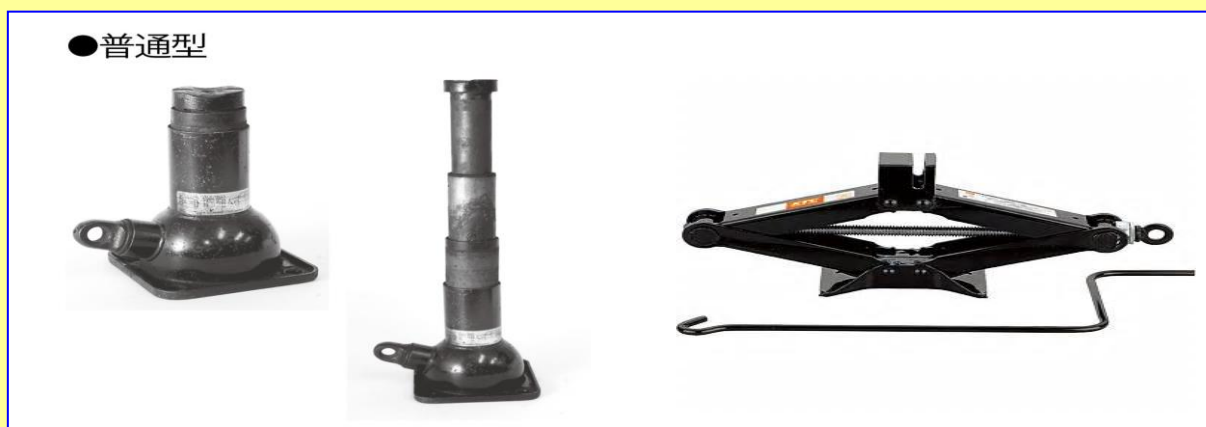
(JACKS) SCREW JACK, PANTOGRAPH JACK