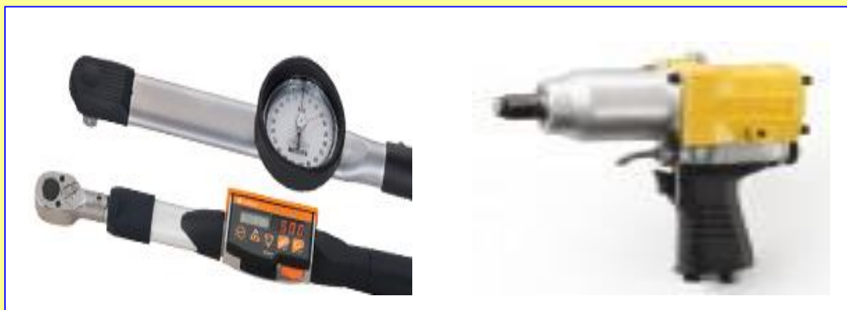
(SERVICE TOOLS) TORQUE WRENCH, AIR TOOLS