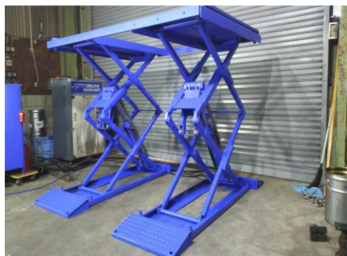
(HYDRAULIC) AUTO LIFT, FLOOR LIFT