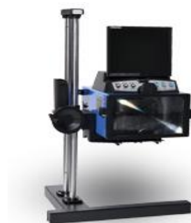
(TESTING AND INSPECTION) SPEEDMETER TESTER, HEADLIGHT TESTER